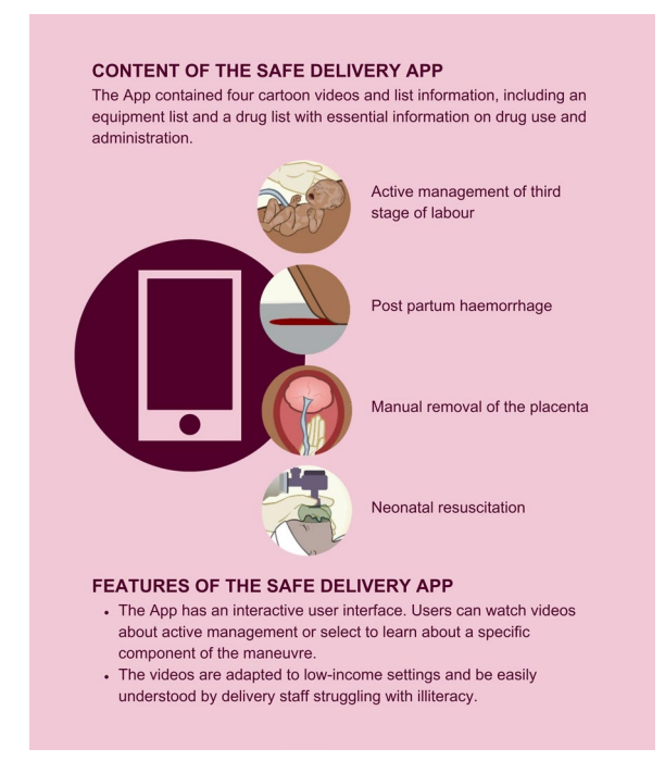
Fig. 1 The Safe Delivery App.

After this trial a full version of the app has been developed including all seven BEmONC signal functions which can be downloaded for free at (https://itunes. apple.com/us/app/safe-delivery/id985603707?mt=8